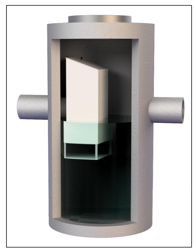
Figure 1. Hydroworks HydroDome

As storm water treatment structures fill up with pollutants they become less and less effective in removing new pollution. Therefore, it is important that storm water treatment structures be maintained on a regular basis to ensure that they are operating at optimum performance. The HydroDome is no different in this regard and this manual has been assembled to provide the owner/operator with the necessary information to inspect and coordinate maintenance of their HydroDome.